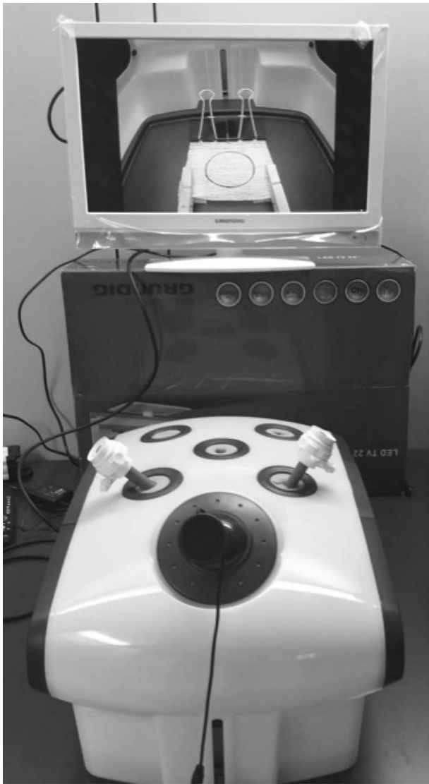
Figure 1. Tablet-based cardboard box trainer.

many different types of low-cost homemade trainers have been developed. [14–21] A particularly promising version consists of a cardboard box with an iPad serving as the camera and display [22] (Fig. 1). Nowadays, tablets are owned by a considerable part of health care providers, especially residents. [23] Therefore, nothing else but a cardboard box is necessary to construct this box trainer, which is particularly convincing since it is cheap and readily available everywhere in the world.