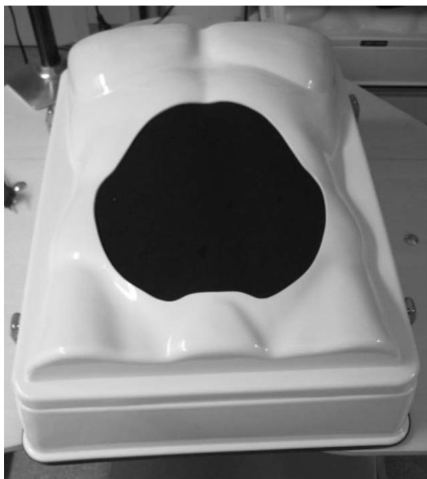
Figure 3. Box trainer used for baseline and post training assessment.

2.4.2. Primary outcome measure. Performance of the 4 FLS tasks was assessed according to the time needed to complete the task as well as the accuracy of task performance using the FLS scoring system as previously described. [4] A staff surgeon, proficient in laparoscopy and with significant experience in surgical training using the FLS tasks, carried out the assessment. The improvement of performance for the total score as well as for each FLS task was calculated by subtracting the baseline test